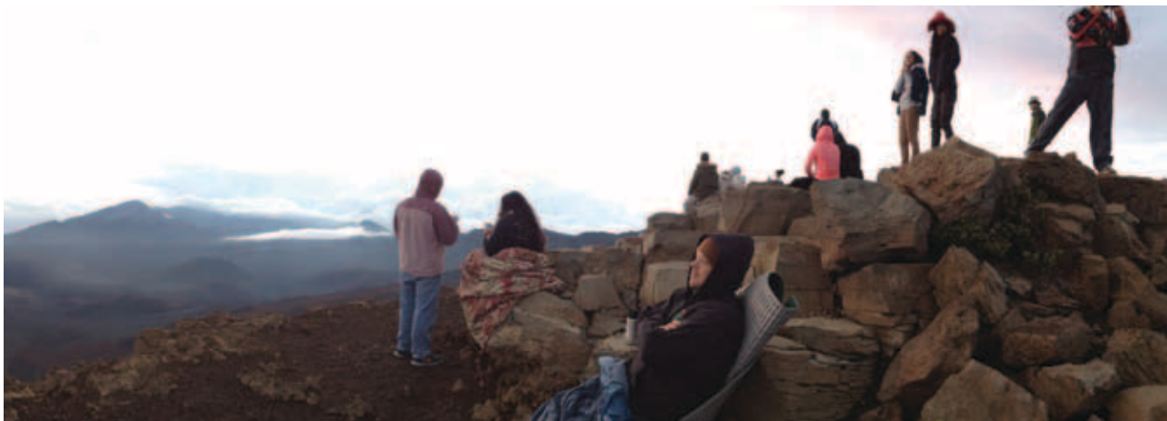
Bundled up against the early morning chill, students in the 2014 Maui Wowie alternate spring break trip await sunrise atop Maui's Haleakala Volcano.

Join other students on a once-in-a-lifetime adventure of learning and community on Maui for your 2015 spring break. Through hands-on opportunities participants will explore tropical plant ecology, traditional taro production, and cultural food ways at four sites across the island. You will also adventure on land and sea to explore different ecosystems and marine life. Like FSWG's Food System Learning Journey's, you can sign-up online in Fall Quarter 2014. Note that a 2-unit Environmental Studies internship is required in Winter 2015 before you depart with your instructors. For more information contact Tim Galarneau, tgalarne@ucsc.edu or (831) 459-3248.