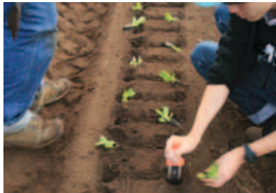
Student interns plant lettuce at the CASFS/UCSC Farm.

UCSC has been a leader in sustainable food and agriculture systems research, education, and public service for more than 45 years. Through the work of the Center for Agroecology & Sustainable Food Systems (CASFS), UCSC students, apprentices, staff, and faculty have developed cutting edge programs in food systems and organic farming research and extension, national and international work in agroecology, an internationally known apprentice training course, an award-winning children's garden, and much more. Members of CASFS have also played key roles in developing UCSC's model farm-to-college